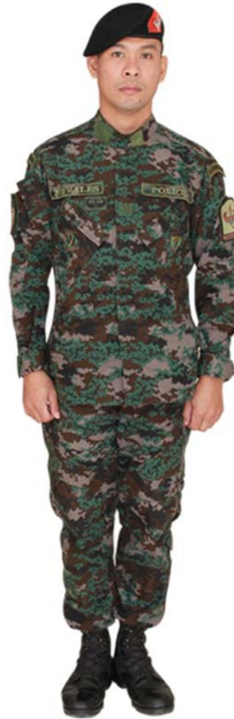
Green Pixelated Printed FSU (Exclusive for SAF personnel only)