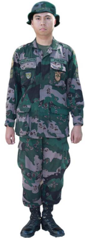
Camouflage Green FSU (Exclusive use of PNP personnel assigned in the various Mobile Group Companies - Regional, Provincial and City - involved in counter insurgency operation in rural and forested areas)