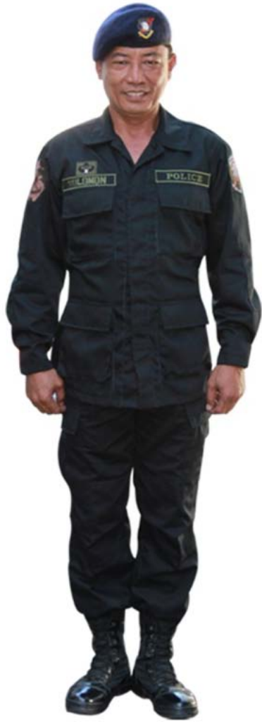
Black Tropical Fatigue FSU (SWAT, EOD, K-9 and SOG of the NSU, administrative and operational, including highly urbanized City Police Offices, Component City Police Stations and Municipal Police Stations)